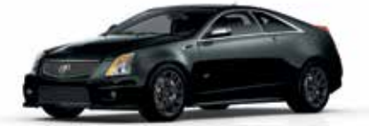
PHANTOM GRAY METALLIC